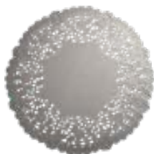
SYSKO CLASSIC | ROUND SILVER DOILIES 10" 1460314 | 1 x 500