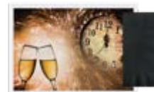
SYSKO CLASSIC | NEW YEAR SYSKO COMBO KIT 4683961 | 2 x 150 | Includes 150 dinner napkins and 150 placements