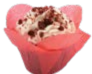
SYSKO CLASSIC | SMALL RED LOTUS CUP 0250854 | 10 x 250