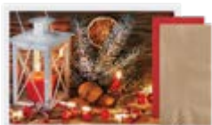
SYSKO CLASSIC | HOLIDAY LANTERN SYSKO COMBO KIT 5277241 | 2 x 150 | Includes 75 red and 75 latte dinner napkins and 150 placements