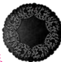
SYSKO CLASSIC | LANCASTER BLACK DOILIES 8" ROUND 1460395 | 2 x 1000