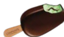
CHAPMAN'S | PISTACHIO & DARK CHOCOLATE BAR 4822817 | 6 x 8 CT