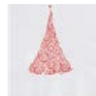
SYSKO CLASSIC | HOLIDAY GLOW BEVERAGE NAPKIN 2194922 | 4 x 125