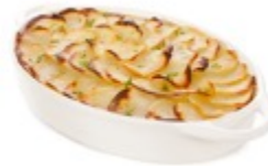
SYSCO CLASSIC | SYSCO® CLASSIC SCALLOPED POTATOES 7517610 | 6 x 2.25 LB