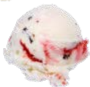
CENTRAL SMITH | WHITE CHOCOLATE WONDER ICE CREAM 3014125 | 1 x 11.4 LT