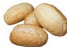
BAKER SOURCE | ASSORTED DINNER ROLLS 0642959 | 140 x 40 GM