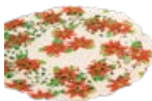
SYSKO CLASSIC | CHRISTMAS POINSETTIA DOILIES 8" ROUND 0343988 | 1 x 500