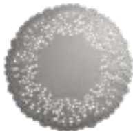
SYSKO CLASSIC | ROUND SILVER DOILIES 8" 1460353 | 1 x 500