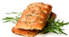
CRUST CRAFT | 10" FOCACCIA BREAD 8014389 | 4 x 1200 GM