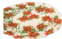
SYSKO CLASSIC | CHRISTMAS POINSETTIA DOILIES 10" ROUND 7234898 | 1 x 500