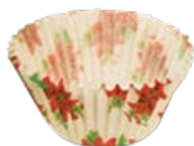
SYSKO CLASSIC | CHRISTMAS POINSETTIA BAKING CUPS 0676502 | 5 x 1000

All these items guaranteed from Oct 1 st to Nov 16 th 2018. After this date: first come, first served.