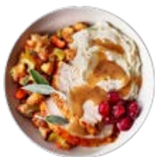
BRILLIANT BEGINNINGS | BRILLIANT BEGINNINGS® MASHED POTATOES 4469401 | 6 x 736 GM