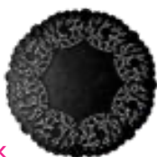
SYSKO CLASSIC | LANCASTER BLACK DOILIES 6" ROUND 1460377 | 2 x 1000