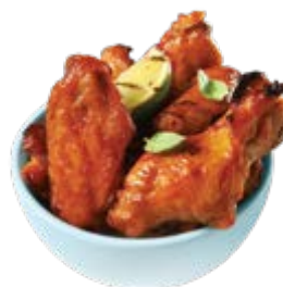
SYSKO CLASSIC | COOKED MEDIUM BREADED CHICKEN WINGS 4112094 | 2 x 2 KG