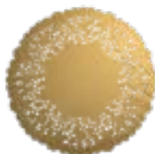
SYSKO CLASSIC | ROUND GOLD DOILIES 8" 1460365 | 1 x 500