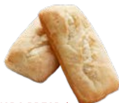
CANADA BREAD | SOFT STYLE WHITE CIABATTA 0439065 | 92 x 6"