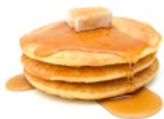
SYSCO CLASSIC | BUTTERMILK PANCAKE MIX 214759 | 6 x 2 KG