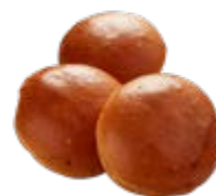
CANADA BREAD | PREMIUM HARISSA BUN 5165182 | 72 x 90 GM