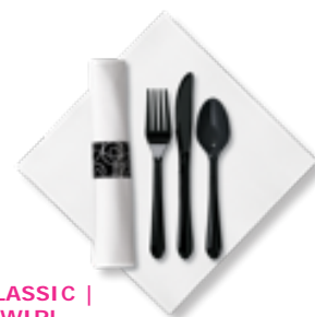
SYSKO CLASSIC | SILVER SWIRL CATER WRAP PRE-ROLLED 4748199 | 2 x 50