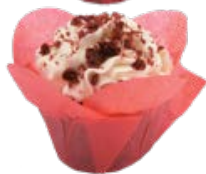
SYSKO CLASSIC | LARGE RED LOTUS CUP 0250825 | 10 x 250