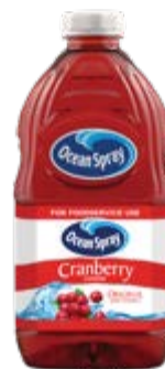
OCEAN SPRAY | CRANBERRY JUICE COCKTAIL 2821106 | 4 x 1.89 LT

Ocean Spray® Ruby Red Grapefruit Juice, fresh lime and a float of grenadine, garnished with a lime wheel.