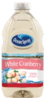
OCEAN SPRAY | WHITE CRANBERRY JUICE 0022778 | 4 x 1.89 LT