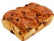
WESTON FOOD | CRANBERRY FOCACCIA BREAD 0237446 | 1 x 12 CT