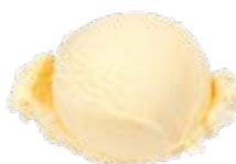
CENTRAL SMITH | FRENCH VANILLA WITH BEAN ICE CREAM 9993080 | 1 x 11.4 LT