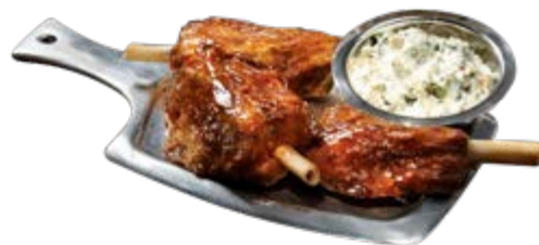
OLYMEL | BRAISED PORK SHANK FULLY COOKED 2114268 | 24 x 160 GM