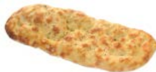
WESTON FOOD | HERB SCHIACCIATA BREAD 2920579 - 15 x 300 GM