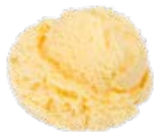
CENTRAL SMITH | EGG NOG ICE CREAM 1760222 | 1 x 11.4 LT