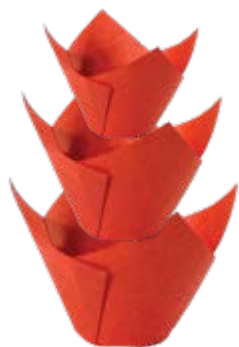
SYSKO CLASSIC | BAKING CUP TULIP RED 150 x 150 x 50 3197617 | 5 x 200