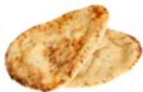
CRUST CRAFT | MINI PANAJI NAAN BREAD 4851612 | 32 x 34 GM