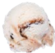
CENTRAL SMITH | POLAR PLUNGE ICE CREAM 3648229 | 1 x 11.4 LT