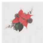
SYSKO CLASSIC | 2PLY POINSETTIA PINES BEVERAGE NAPKIN 3094692 | 4 x 250