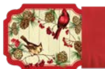
SYSKO CLASSIC | WINTER CARDINALS SYSKO COMBO KIT 4992485 | 2 x 150 | Includes 150 dinner napkins and 150 placements