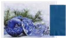
SYSKO CLASSIC | ELEGANT ORNAMENTS SYSKO COMBO KIT 5277286 | 2 x 150 | Includes 150 dinner napkins and 150 placements