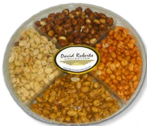
DAVID ROBERTS | FOUR POCKET PEANUT WHEEL SNACK TRAY 4526419 | 12 x 700 GM

All products are available after October 1, 2018