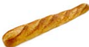
WESTON FOOD | SLICED WHITE BAGUETTE BAGEL ROLL 4873861 | 70 x 75 GM