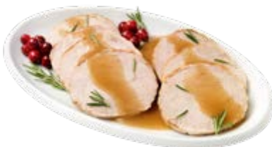
FLAMINGO | ROASTED COOKED LOW SODIUM TURKEY BREAST 0990127 | 6 x 1.1 KG