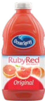
OCEAN SPRAY | RUBY RED GRAPEFRUIT JUICE 2821072 | 4 x 1.89 LT

Ocean Spray® White Cranberry Juice Cocktail shaken with fresh lemon and mint, drizzled with blackberry syrup and garnished with a mint sprig.