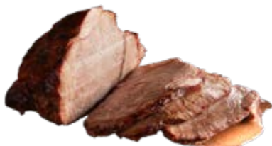
CARDINAL | HALAL BEEF POT ROAST AU JUS - LARGE CUT (FULLY COOKED) 4523445 | 3 x 4.54 KG