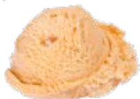
CENTRAL SMITH | PUMPKIN PIE ICE CREAM 9889916 | 1 x 11.4 LT