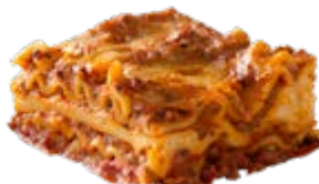
CAMPBELL'S | LASAGNA CLASSICO WITH MEAT 3083581 | 4 x 6 LB