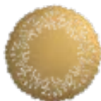
SYSKO CLASSIC | ROUND GOLD DOILIES 6" 1460324 | 1 x 500

All these items guaranteed from Oct 1 st to Nov 16 th 2018. After this date: first come, first served.