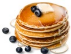
SYSCO CLASSIC | BUTTERMILK PANCAKE MIX 7803408 | 1 x 20 KG