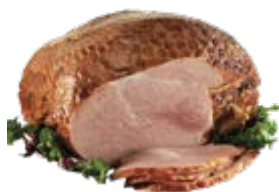
BLOCK & BARREL | RAISED WITHOUT ANTIBIOTICS TOUPIE HAM 0111823 | 2 x 6.5 KG