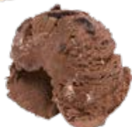
CENTRAL SMITH | BLACK FOREST CAKE ICE CREAM 4770634 | 1 x 11.4 LT